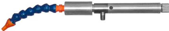
Nex Flow™ Frigid-X™ Adjustable Spot Cooling System Above.

Adjustable spot cooling systems are preferred obviously when some adjustability is required by the customer such as in cooling ultrasonic horns. For cooling machine tools to replace some coolants and most mist coolants, fixed units tend to be preferred. Adjustable units and fixed units are essentially the same except for the adjustable knob at the “hot” end.