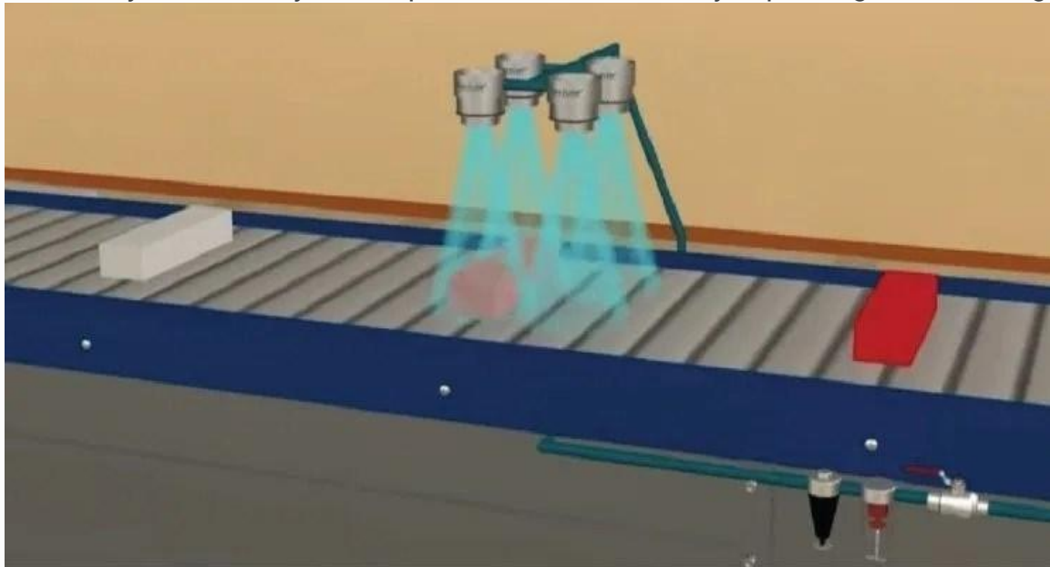
Cooling with compressed Air Amplifiers