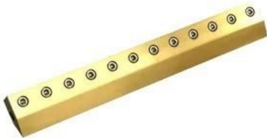
X-Stream Air Blade Air Knife has the air coming out straight. Most efficient air knife design.

Let's take the situation where compressed air is the choice. Some applications are best suited to air knives, some rows of flat jets, some rows of engineered nozzles, sometimes annular flow amplifiers. Certain applications are best served by a certain product type.