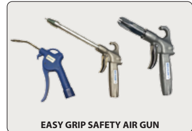
EASY GRIP SAFETY AIR GUN

All air amplifying nozzles used with Nex Flow™ Safety Air Guns produce up to 25 times the compressed air consumed. Noise reduction up to 10 dBA is typical as well as reduced air consumption when compared to open jets and tubes. All Nex Flow Safety Air Guns with Nex Flow Nozzles meet OSHA standard CFR 1910.242(b) for dead end pressure.