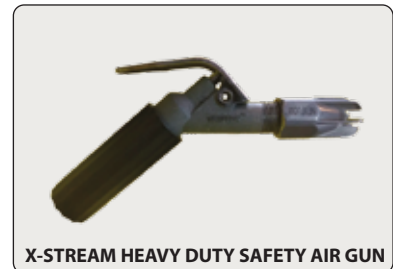
X-STREAM HEAVY DUTY SAFETY AIR GUN