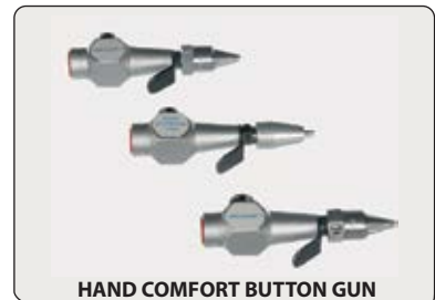
HAND COMFORT BUTTON GUN