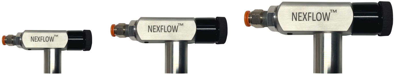
Blind Hole Cleaning System for Automated Systems (non-manual)

Blind Hole Automated Cleaning System is used on machine everywhere an automated cleaning device is preferred over manual operation for cleaning a blind hole. Instead of using the air supply gun in manual cleaning operations, these systems utilize the main attachment with the appropriate adapter for the holediameter. The same nozzles as used in the manual systems areutilized. Compressed air is supplied directly tothe unit and turned on/off as the customer desires in their design using appropriate times, sensors and solenoidvalves. Nex Flow® can assist in this area with accessories and design for a nominal additional cost should the customer require assistance.